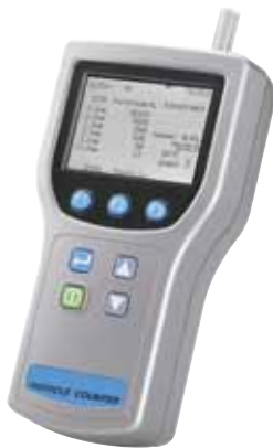
HHPT-51, Handheld Particle Counter.

In any manufacturing, but particularly high technology, particulate management is a quality assurance—quality control issue. Use a portable instrument to measure and report air contamination and download data to a personal computer using the USB interface cable.