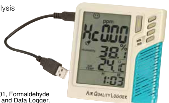
AQM-101, Formaldehyde Monitor and Data Logger.

In 2015, The Formaldehyde Act under the Toxic Substances Control Act (TSCA), extended regulations to reduce emissions of formaldehyde from composite wood products, like flooring products used in the course of scientific research and other professions where tissue is preserved in some manner.