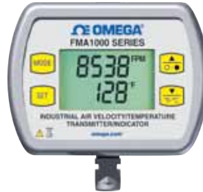
FMA1000, General Purpose Industrial Air Velocity/Temperature Transmitter/Indicator.

Comfort creates productivity. Too hot or cold, low oxygen, high humidity environments are just distracting, or worse, sleep inducing.