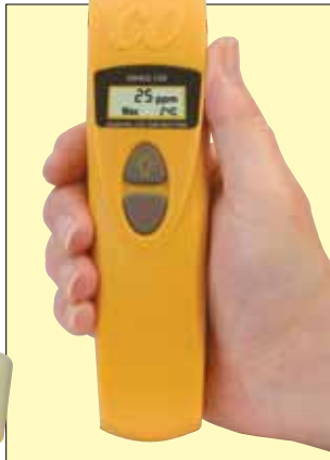
HHAQ-105, Handheld Carbon Monoxide (CO) Monitor.

There are a variety of Carbon Monoxide Monitors and Data Loggers available to detect indoor air quality (IAQ) diagnosis and HVAC system performance verification.