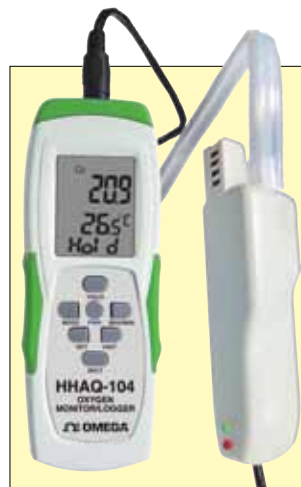
HHAQ-104, Portable Oxygen Monitor and Data Logger.

Increased pressure actually raises the ambient temperature as well. A balance between temperature control and barometric pressure control must be designed into the system. Balance is key. A wide variety of instruments are available for indoor air quality (IAQ) diagnosis and HVAC system performance verification. Measure O 2 concentration, pressure, air temperature and relative humidity.