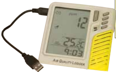
AQM-103, Carbon Monoxide Monitor and Data Logger.