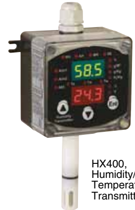
HX400, Humidity/Temperature Transmitter.

Modern buildings attempt to “positive pressure” the indoor environment to prevent mold spores from entering the building through leaks in the envelope.