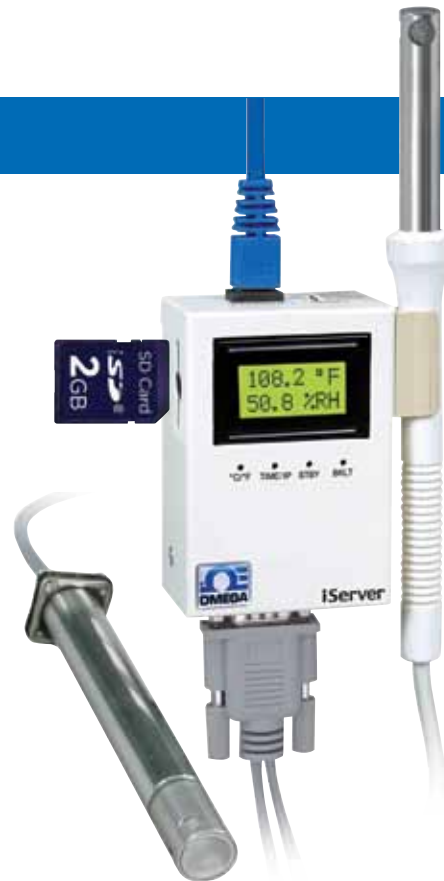
iTHX-SD-5D shown smaller than actual size with SD card and DB9-Y cable for dual probe (included).

Conclusion: Remote monitoring is ideal for applications in dangerous or harsh environments where conditions are relatively stable and adjustment to equipment parameters can be made remotely.