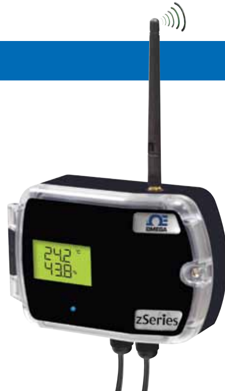
zED-TC-LCD-DC-H2 shown smaller than actual size.

Wireless monitoring uses the same Wi-Fi technology as home or business networks. It is very fast. Wi-Fi signals can be