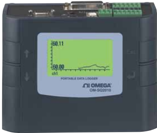
OM-SQ2010 data logger shown smaller than actual size.

environmental monitoring such as temperature or humidity, and data transfer between computers.